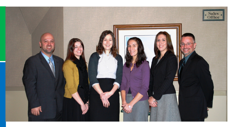
Mill Falls at the Lake Sales Group